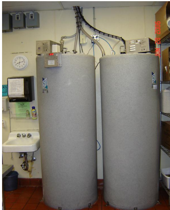
Figure PTP-07- 2 Internal Grease Collection System

Although the City of Bowling Green does not endorse specific brands or products, one example of an internal collection system manufacturer and provider is Restaurant Technologies, Inc. (RTI). More information about RTI products can be found on their website, www.rti-inc.com .